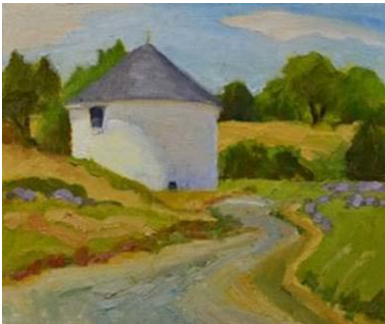
"Delaney Farm Round Barn" 10 x 12 Oil/Linen/Panel Click on image for more information

To purchase these paintings, contact: Framed Image 5066 East Hampden Ave. Denver, CO 80222 303-692-0727 Hours: Tue-Fri 10-5:30, Sat 10-5 info@framedimage.net www.framedimage.net