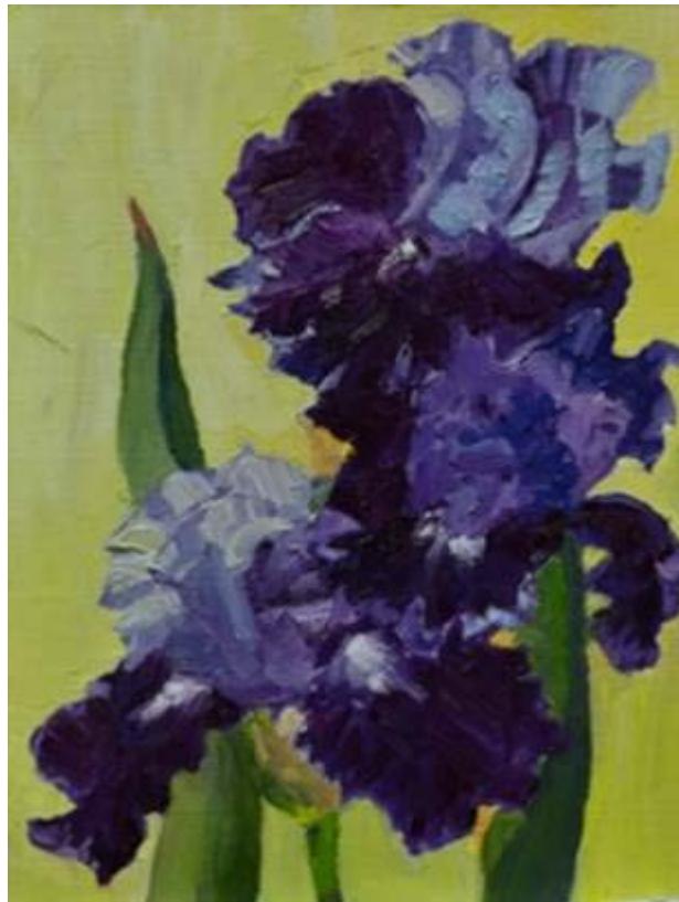
"Triplets" 12 x 9 Oil/Linen/Panel Plein Air Click on image for more information

And this Iris was juried into the 2016 Plein Air Artists Colorado 20 th Exhibition!