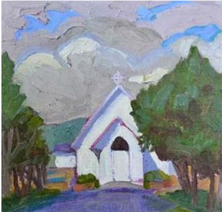
"St. Philip in the Field" 10 x 10 Oil/Linen/Panel Click on image for more information