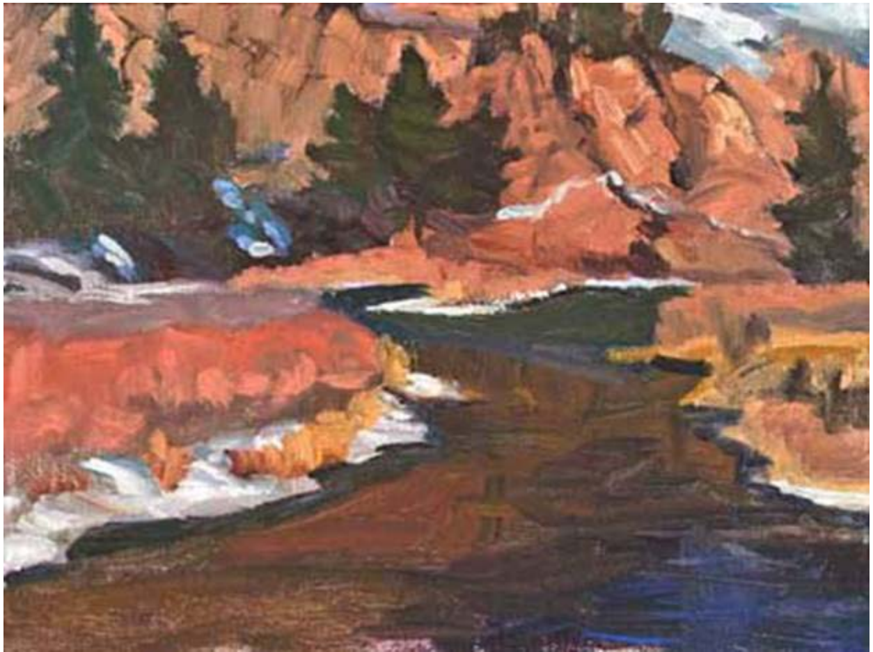
©South Platte River Deckers 9 x 12 Oil/Linen/Panel Plein Air