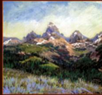
Teton Range , 12 x 16, pastel

Tucson Desert Art Museum, 7000 E. Tanque Verde Rd, Tucson, AZ (520)202-3888 www.tucsonart.org