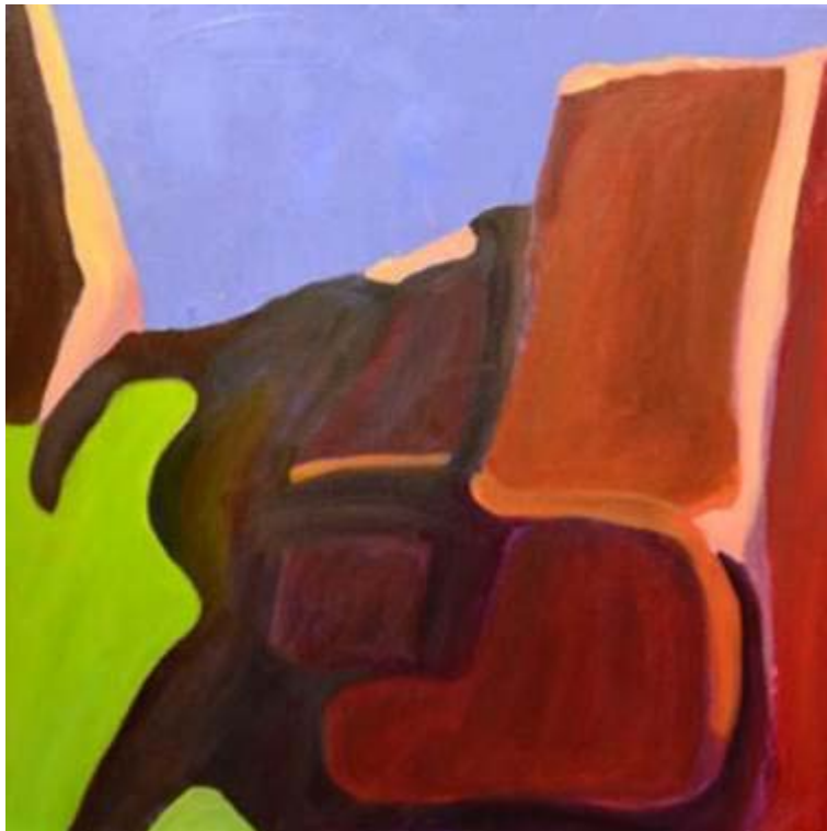
©"Sedona Abstract II-2" 24 x 24 Oil/Canvas

See these pieces from the Landscape to Abstract Series: