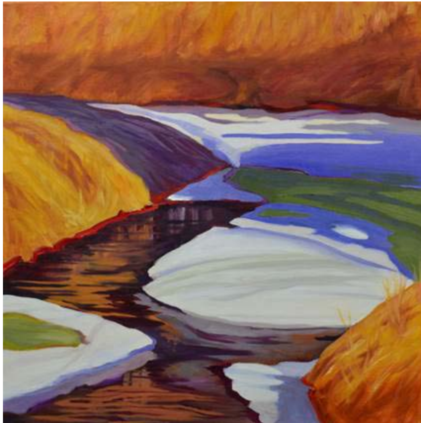
©"Abstracted Winter Stream" 24 x 24 Oil/Canvas