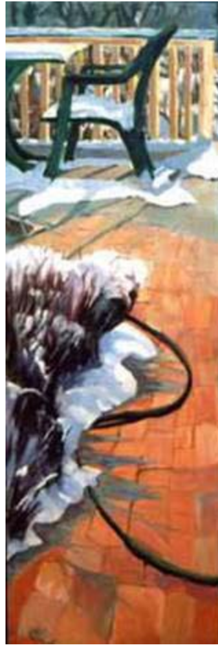
© Winter AI Fresco 30 x 10 Oil/Canvas

Click on the images for more information.