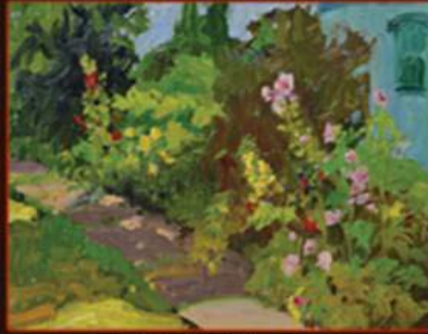
Five Points Hollyhocks , 11 x 14, oil