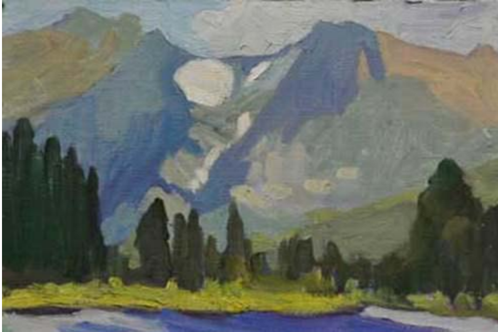
©Tyndall Glacier RMNP 6 x 9 Oil/Linen/Panel Plein Air