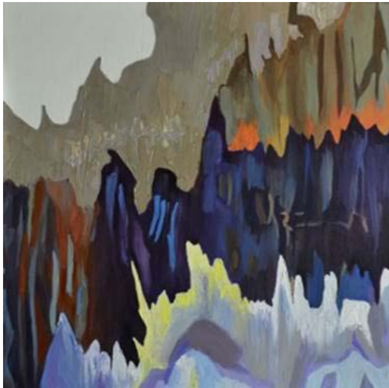
©"Abstracted Winter Stream II-2" 24 x 24 Oil/Canvas