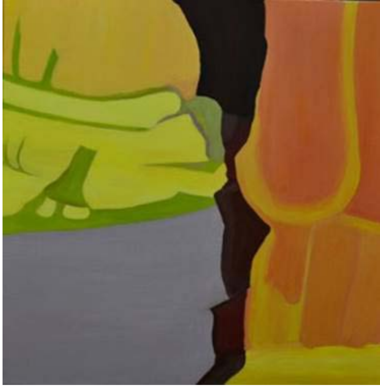
©"Sedona Abstract III - 2" 24 x 24 Oil/Canvas