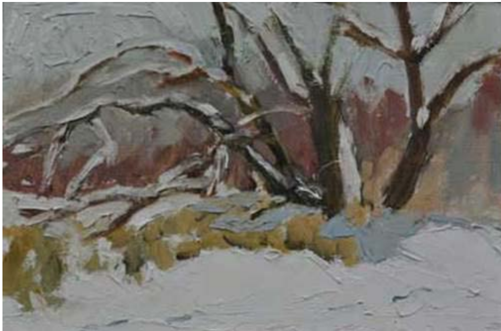
©Bible Park Winter 6 x 9 Oil/Linen/Panel Plein Air

Don't forget to call and make an appointment to visit the studio! 303-752-2029