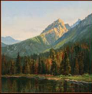
Last Light at String Lake , 18 x 18, oil