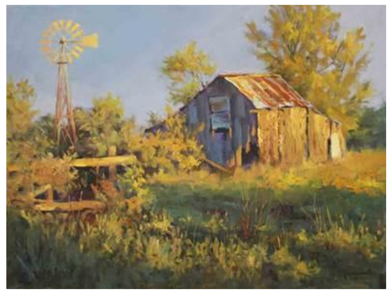
Chuck's "Nemo Barn" 18 x 24 Oil

• What are your plans for the future? Where do you want to take your work in the future?