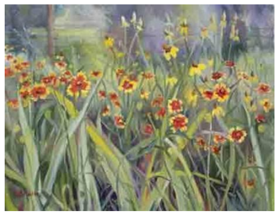
Barb's "Indian Blankets and Friends" 14x18 Oil

What percentage of time do you paint in the studio...Plein air?