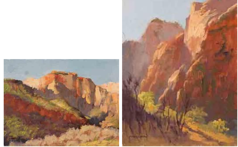
Chuck's "West Temple of Zion" 9x12 Oil

They recently painted in Zion! Feast your eyes on these awesome pieces.