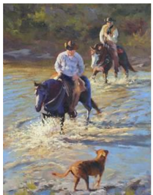
Chuck's "Crossing the Creek" 18 x 14 Oil OPA Western Regional!

• Tell us something we don't know about you?!