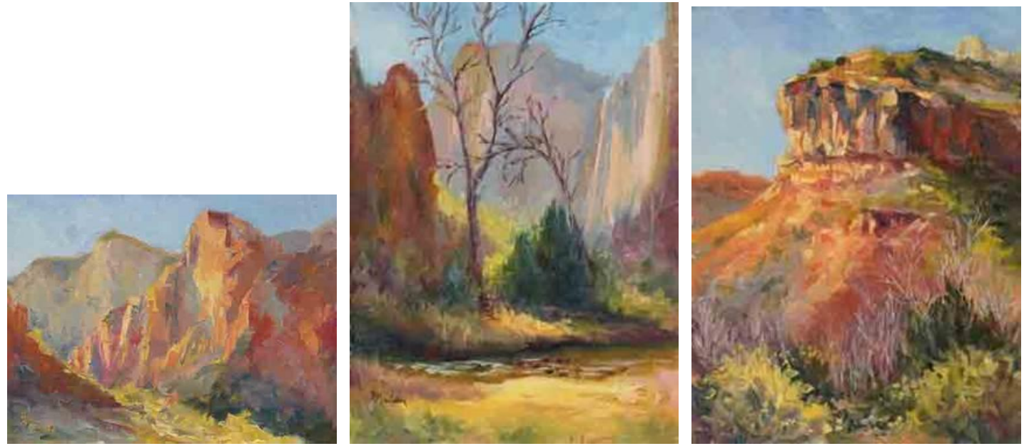
Barb's "Canyon Country" 6x8 oil Barb's "Morning Light at Zion" 12x9 Oil Barb's "Zion Splendor" 12x9 Oil

Barb says: "I used the warm and cool Portland Grays (Gamblin) that Kevin Macpherson suggested, and I found them extremely useful at Zion".