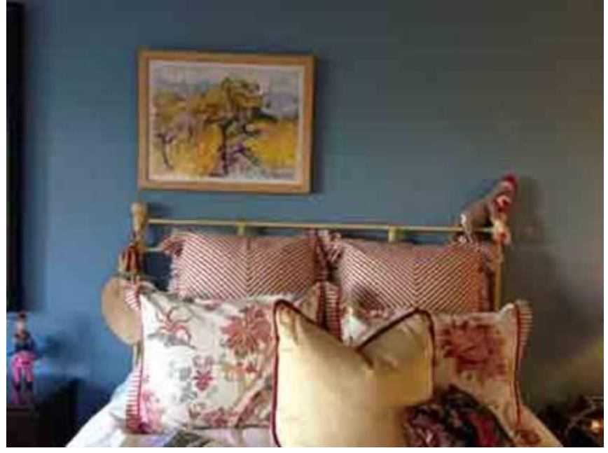
This was an earlier oil on paper abstract! The collector wrote: "I love it next to my yellow bed frame!!"

We love to see installation photos of my paintings in your homes! Here is one we received recently: