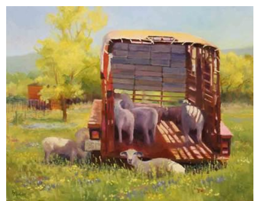
Barb's "Mobile Home" 16x20 Oil WAOW Show in TX!