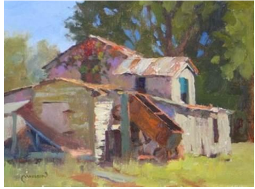
Chuck's "Rosedale Syrup Mill"