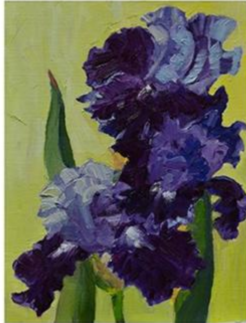
Leslie Allen "Triplets" oil