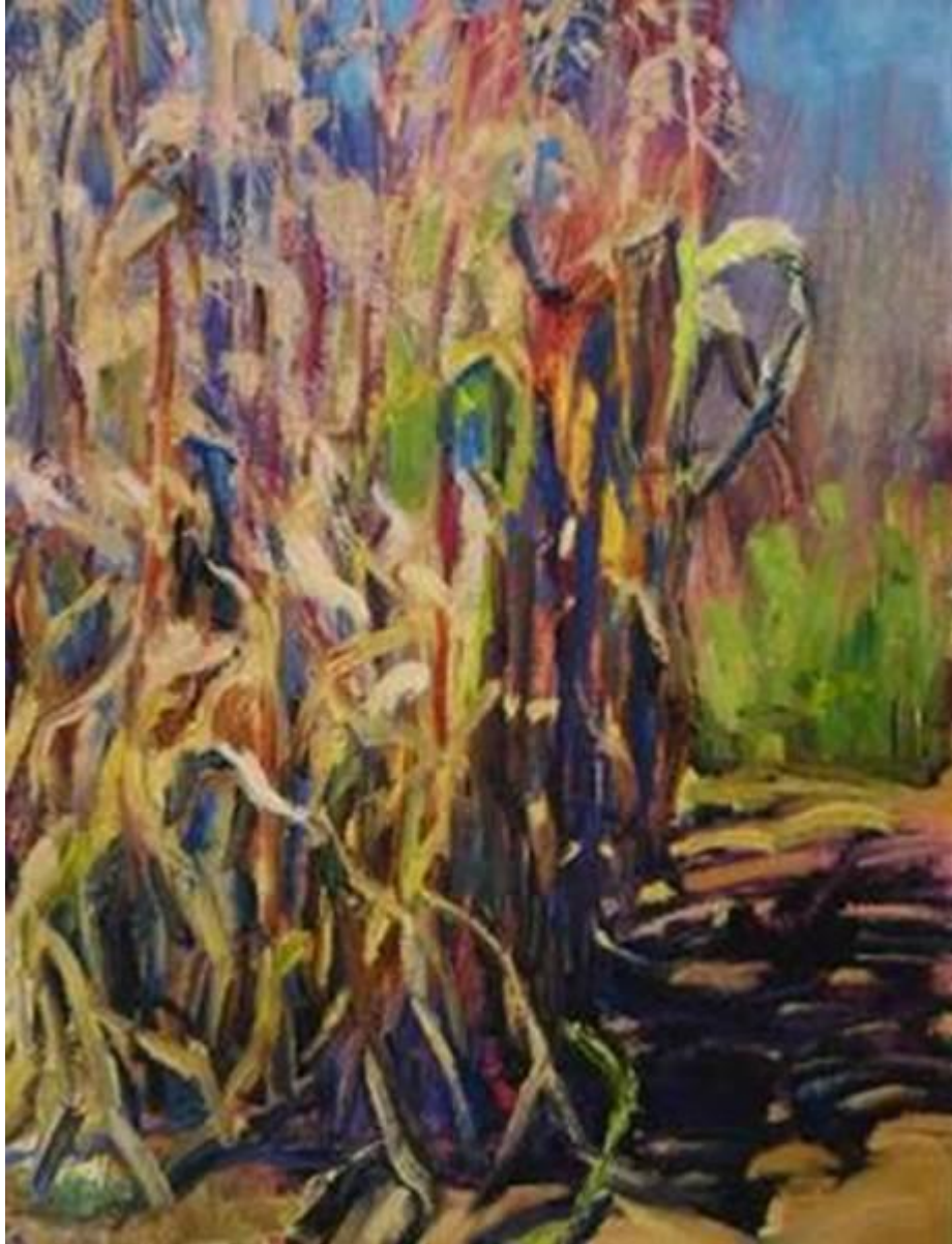
©The Corn Patch 16x12 Oil/linen/panel PA

This was fun to paint! The first one that catches the eye of visitors to the studio.