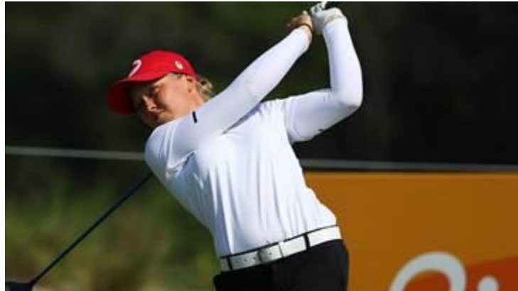
Brooke Henderson playing for Canada in the Rio Olympics! Just had to say how proud we are of her. https://www.facebook.com/BrookeHendersonGolf