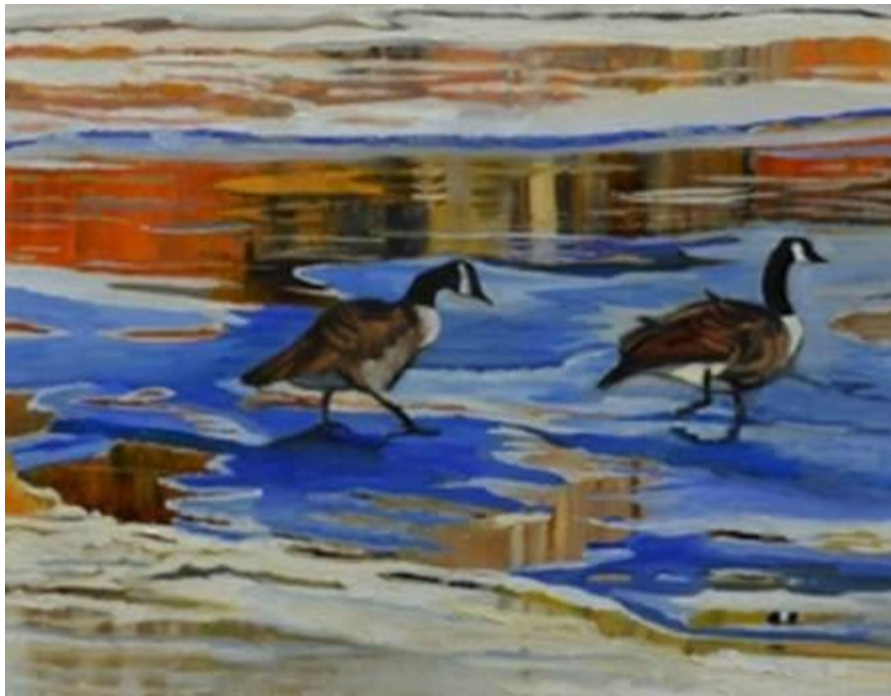
©"Canadians Ice Skating" 14 x 18 Oil/Linen/Panel

2016 Women Artists of the West 46th National Exhibition at the RS Hanna Gallery 208 South Llano Street Fredericksburg, Texas 78624 November 15 – December 13, 2016