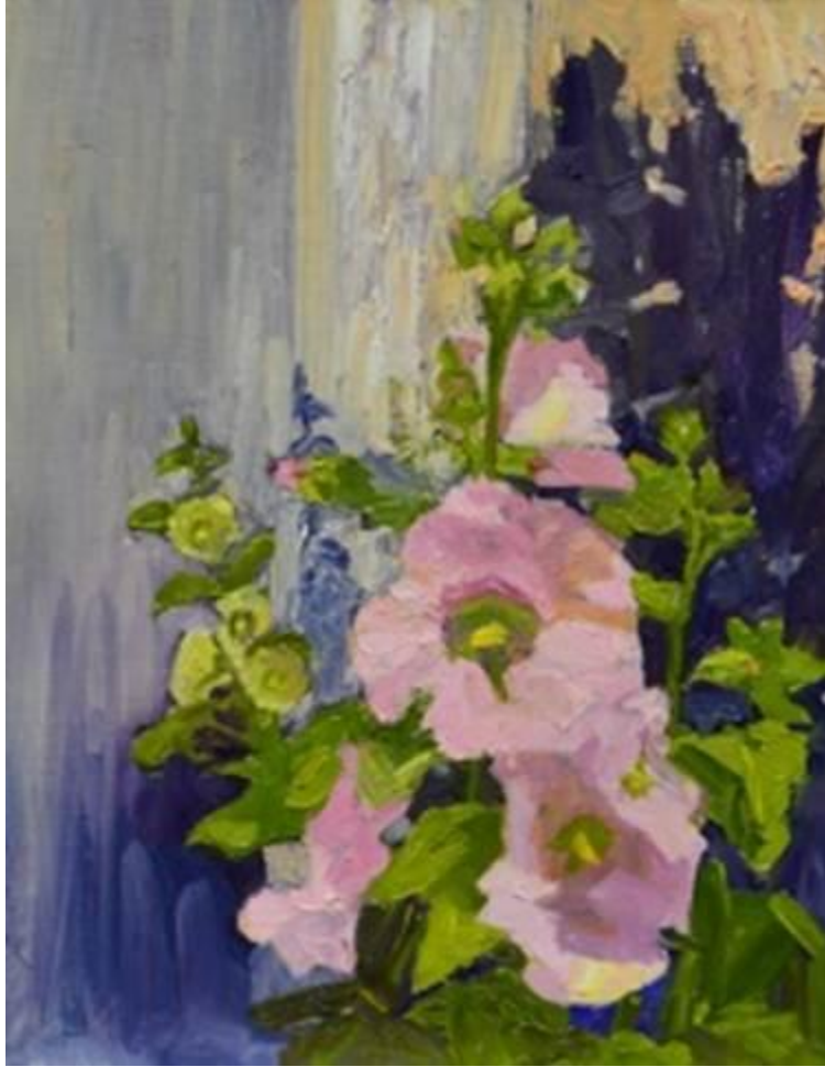
© "2016 Hollyhocks Abstracted" 14 x 11 Oil/Linen/Panel PA