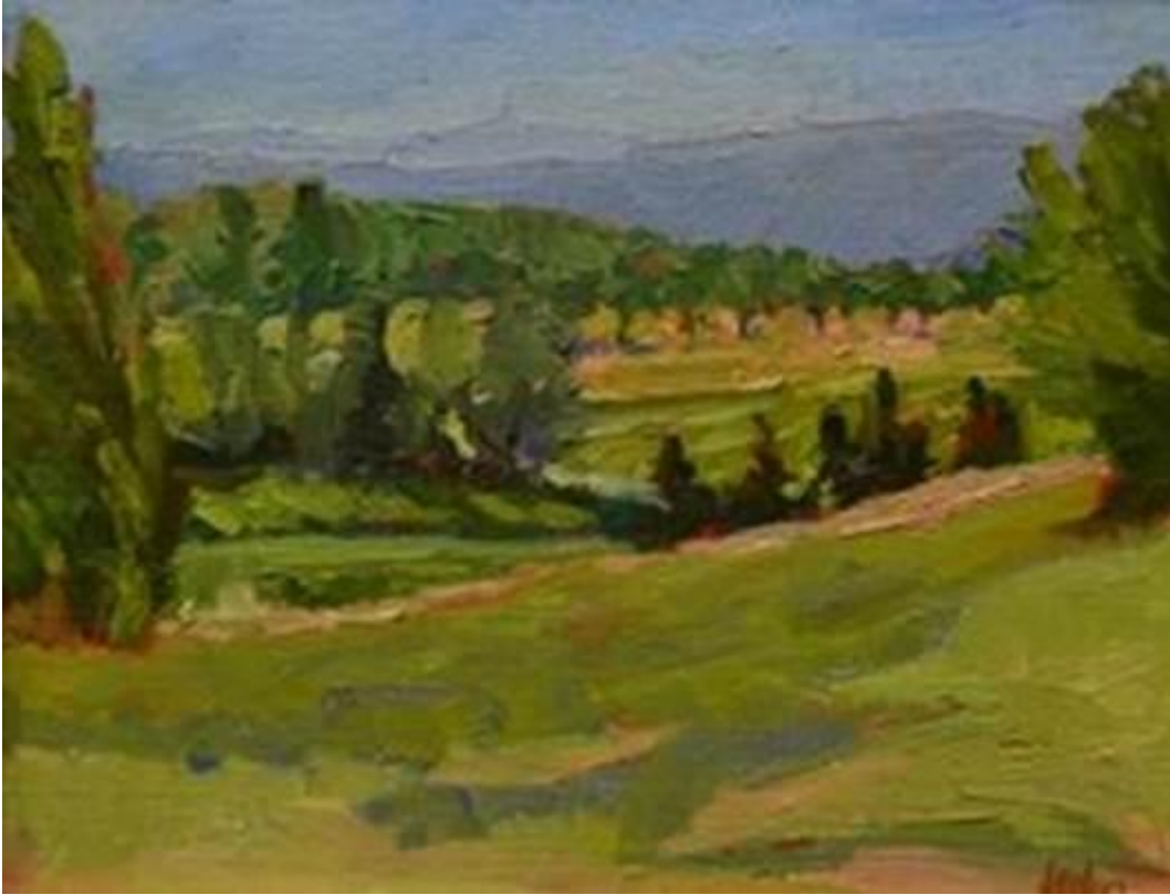
©Cherry Hills Morning 8x10 Oil/linen/panel PA

If you live in Cherry Hills, you ought to have this little gem in your collection! The view from the Highline Canal.