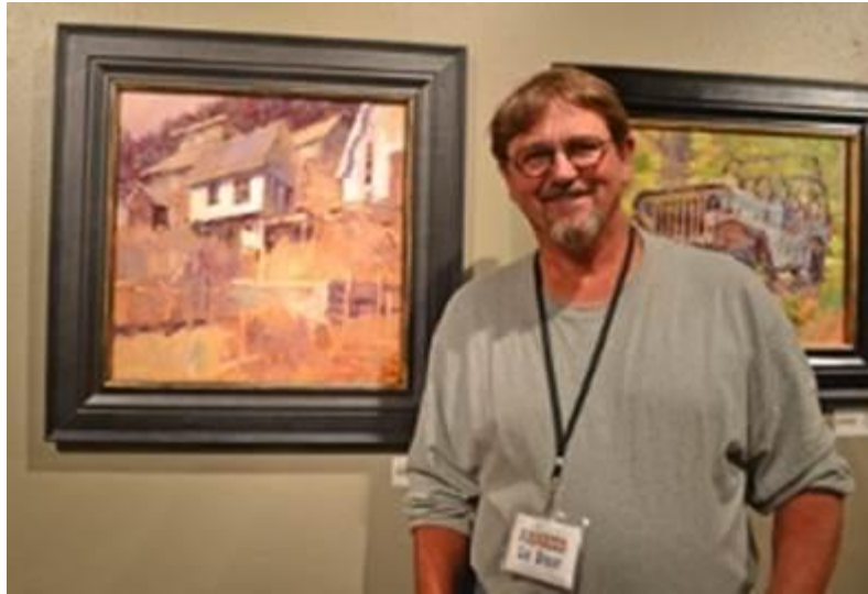
"House on the Rocks" 20x20 Oil $2250

The one that pops off the wall at you....that's it!