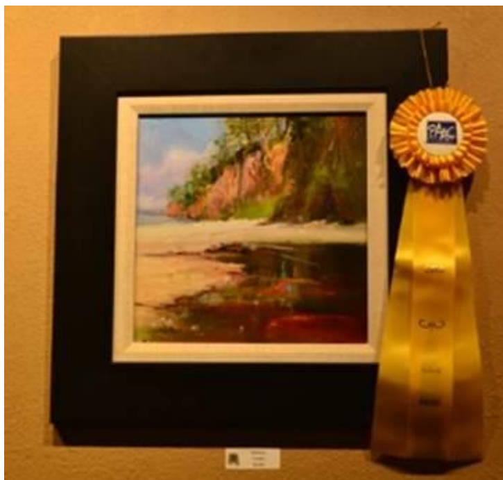
"Capitola" New Brighton Beach, CA Oil 12x12 $975

Available from Mary Williams Fine Arts, Boulder CO. 303-938-1588