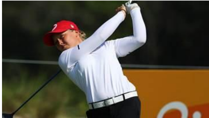
Brooke Henderson playing for Canada in the Rio Olympics! Just had to say how proud we are of her. https://www.facebook.com/BrookeHendersonGolf