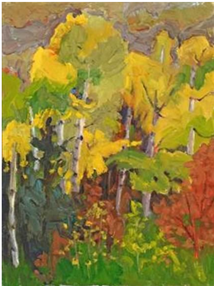
©County Rd 5 Out of Ridgway 12x9 Oil/linen/panel PA

Just the most beautiful spot on the way into lovely town on the western slope.