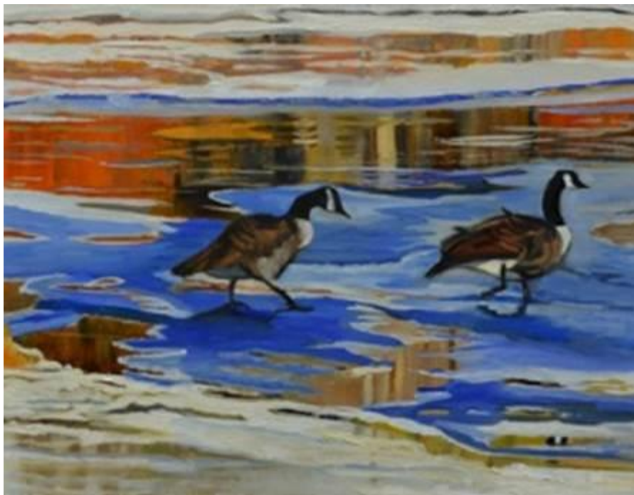
©"Canadians Ice Skating" 14 x 18 Oil/Linen/Panel

2016 Women Artists of the West 46th National Exhibition at the RS Hanna Gallery 208 South Llano Street Fredericksburg, Texas 78624 November 15 – December 13, 2016