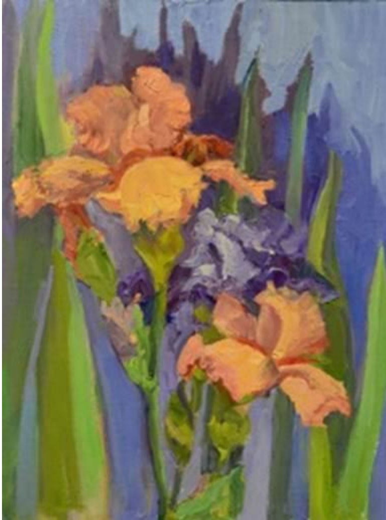
©'My Avalon Sunset 16 x 12 Oil/Linen/Panel Plein Air

This beauty is also in the show; my Founder Emeritus piece.