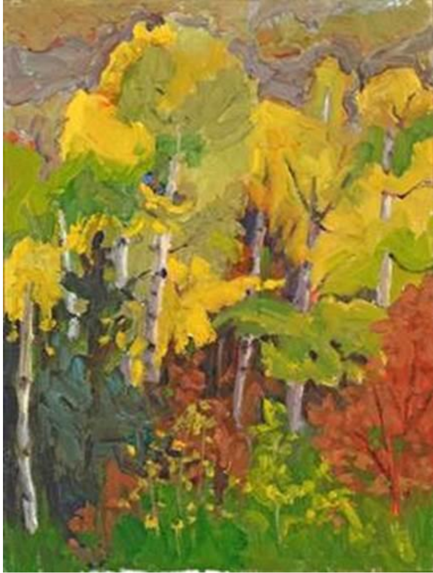
©County Rd 5 Out of Ridgway 12x9 Oil/linen/panel PA

Just the most beautiful spot on the way into lovely town on the western slope.