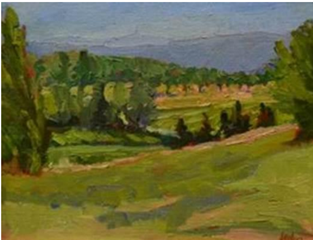
©Cherry Hills Morning 8x10 Oil/linen/panel PA

If you live in Cherry Hills, you ought to have this little gem in your collection! The view from the Highline Canal.