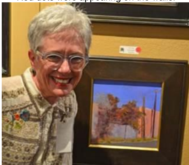
Clare Scott's "Simple Shapes" Pastel, 10x10