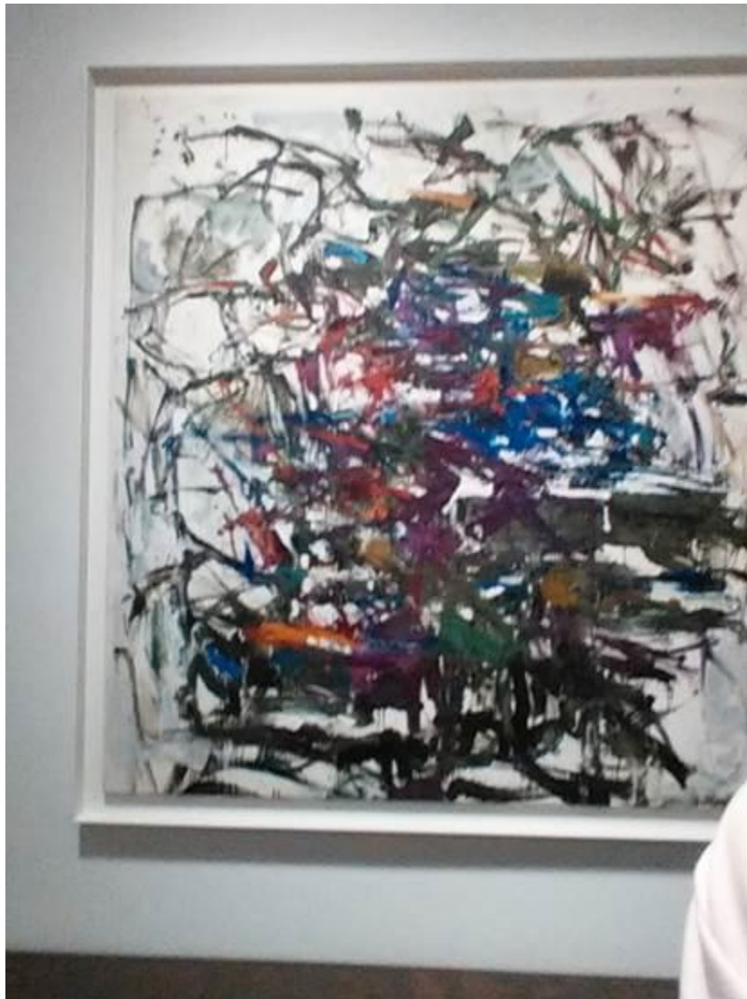
Joan Mitchell, a favourite of mine!