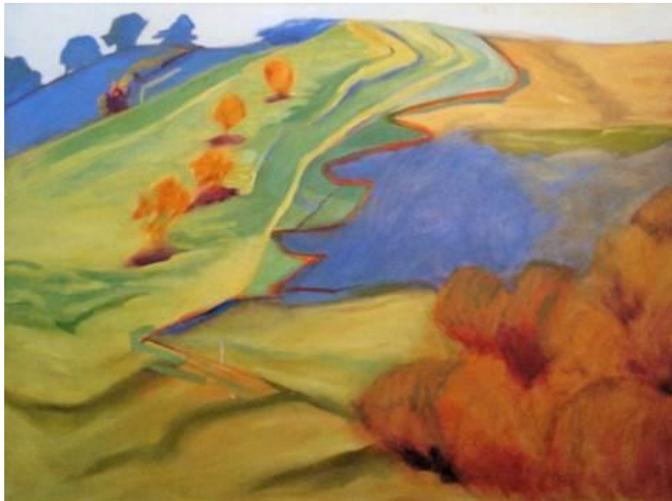
© "Land Pattern Series #5" 30 x 40 Oil/Canvas

During a trip back to Ontario, Canada in May 2003, I was just blown away by the colours and shapes of the land patterns while driving through the Missouri Valley in Iowa. I was inspired to create these abstracted land pattern paintings.