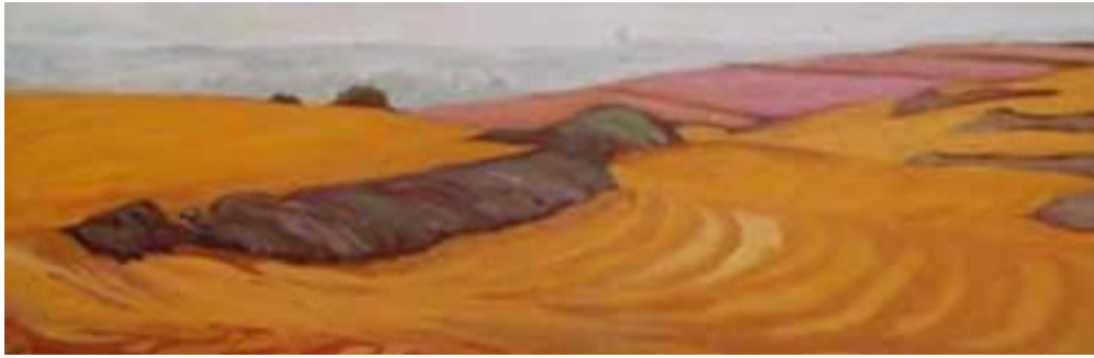
“Land Pattern Series #13”

“Frisco Log Cabin” found a new home in Canada!