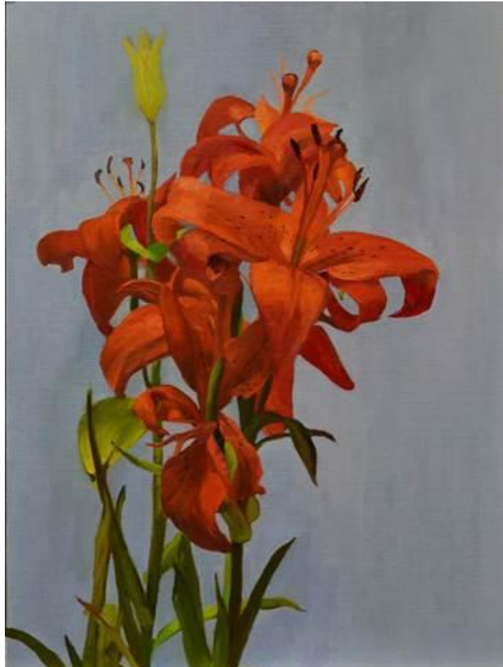
"Daylilies from David" 24 x 18 Oil/Linen/Panel

"ORANGE IS THE NEW RED" March 1 st to April 30 th , 2016