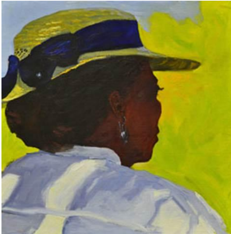
"Dreams and Ambitions" 16x16 Oil/linen/panel

To purchase this painting, contact: CAC Fine Art Gallery Cultural Arts Council of Estes Park 423 W. Elkhorn Estes Park, Colorado 80517 970-586-9203 info@estesarts.com