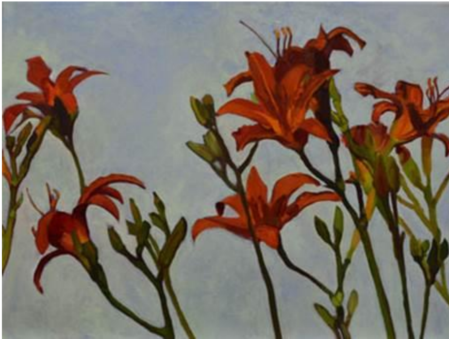
"Daylily Dance" 18 x 24 Oil/Canvas