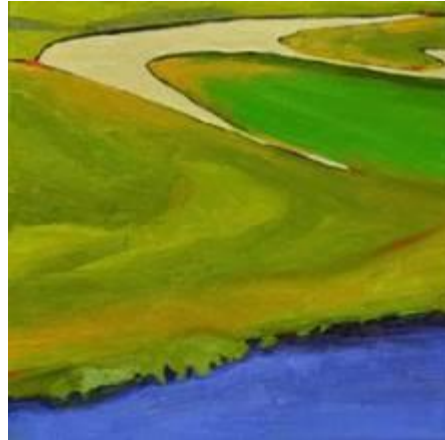
“Golf Series #7” in progress