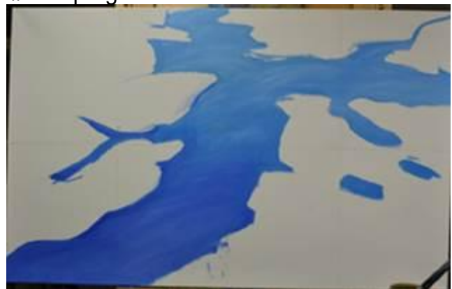
“Golf Series #6” in progress Stay tuned!

..... I delivered dozens of new cards to the Papery card shop this week! Including this new image: